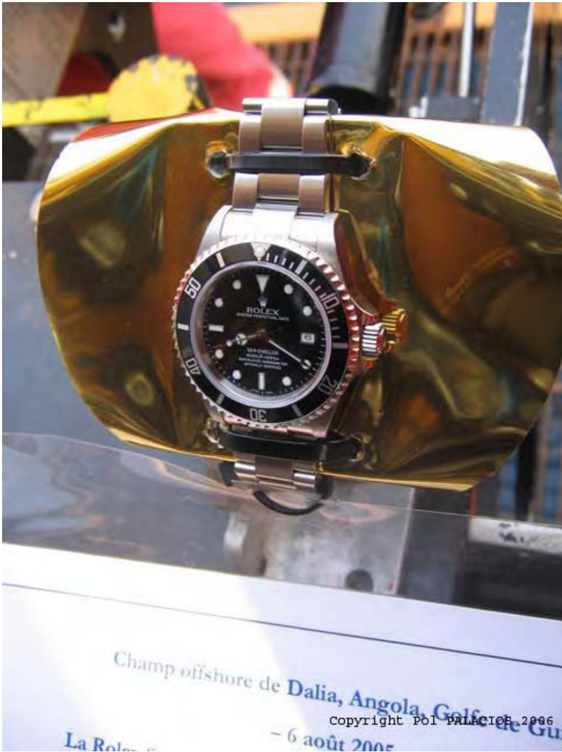
4- A view of the ROV (Remote Operated Vehicle).