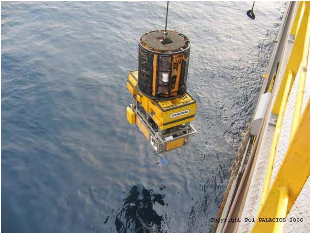
5- The Sea-Dweller on all remote control screens.