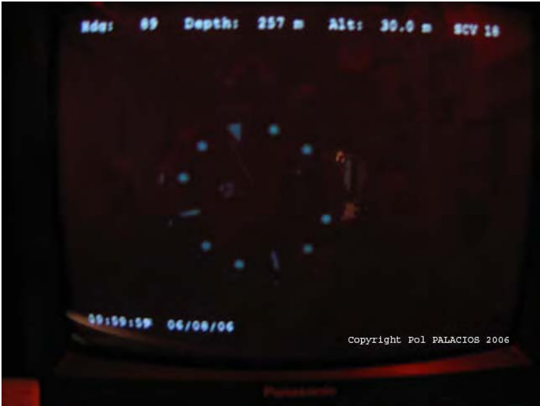
9- The Sea-Dweller...?