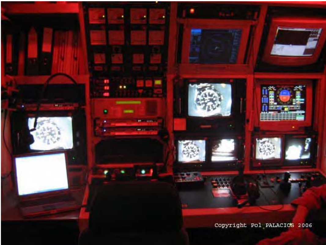
6- Look at the screen, the Rolex reached 1200 meters, that is a pressure on the crystal of about 1200kgs. Sea-Dweller where it belong... deep sea.