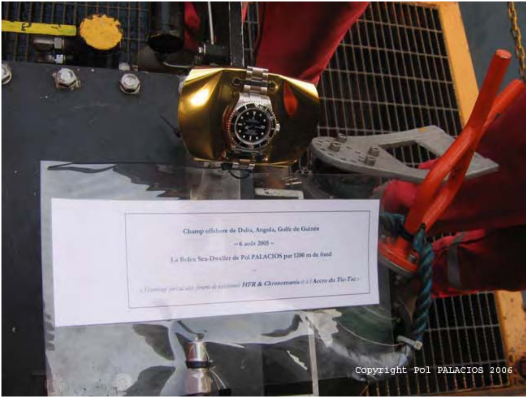
3- Ready for diving in a few minutes....