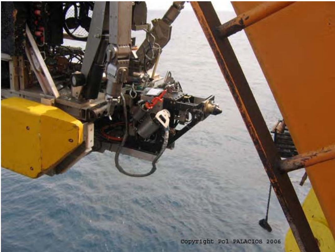
10- Alive and well, the SD kept good time and did the job.