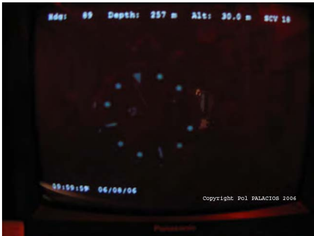
9- The Sea-Dweller...?