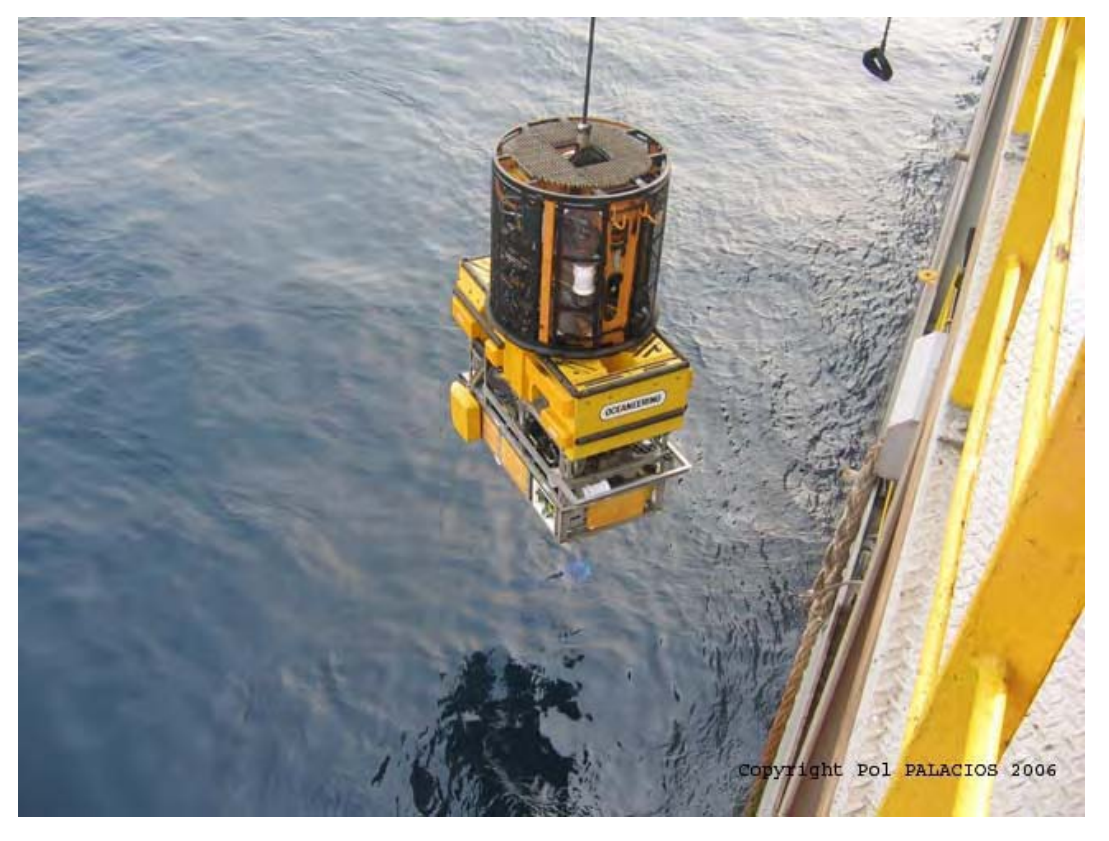
5- The Sea-Dweller on all remote control screens.