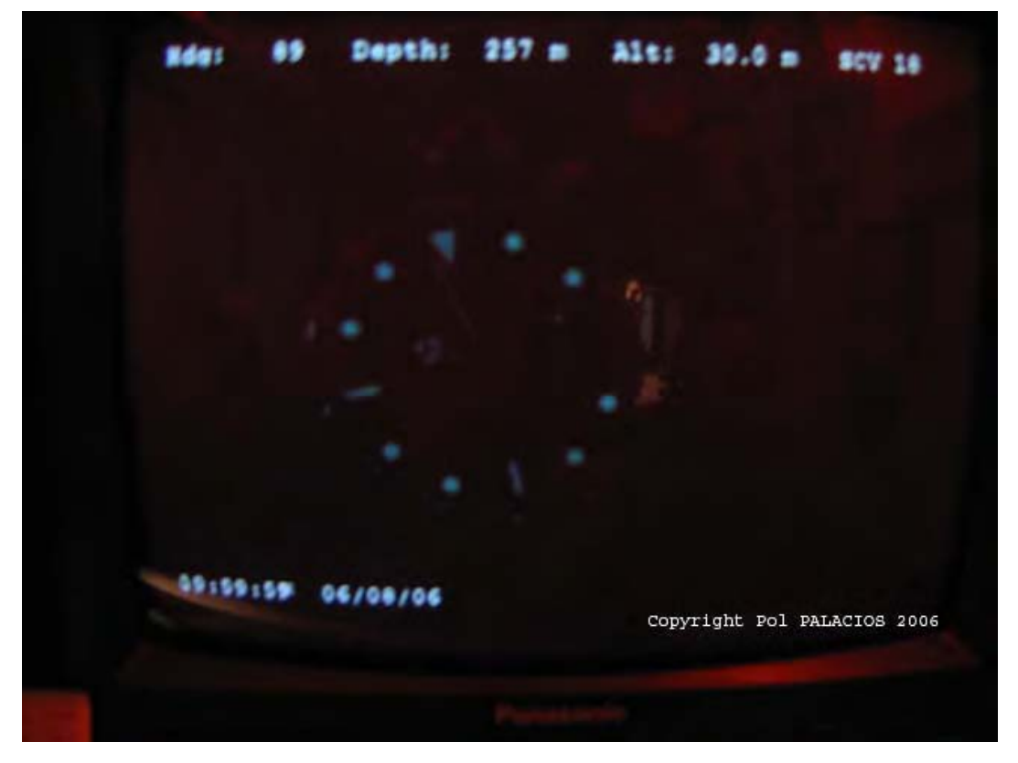
9- The Sea-Dweller ...?