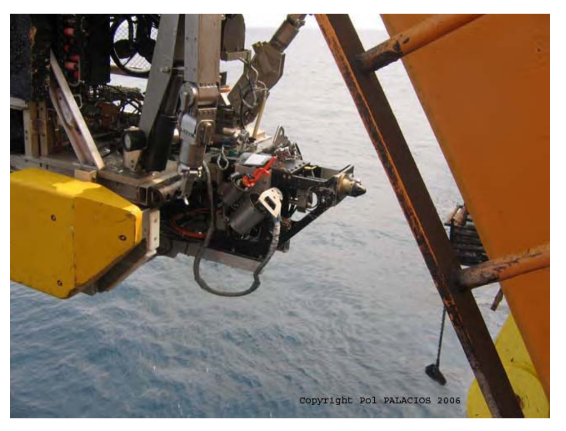
10- Alive and well, the SD kept good time and did the job.