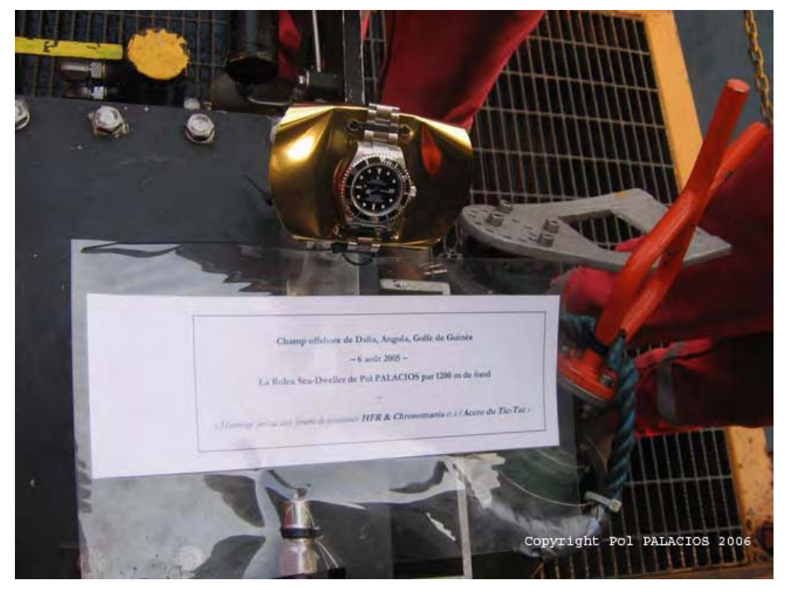
3- Ready for diving in a few minutes....