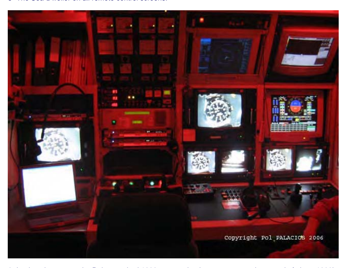
6- Look at the screen, the Rolex reached 1200 meters, that is a pressure on the crystal of about 1200kgs. Sea-Dwellet where it belong... deep sea.