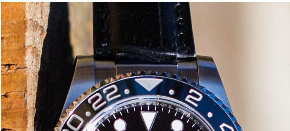
Standard Leather Strap: Unsightly Gap Between Case and Strap!