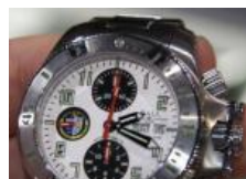
My Favorite Ball Watches At JCK, Big