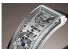
Eva Leube Ari Watch