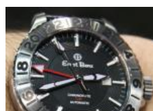
Awesome Ernst Benz Chronoflite GMT