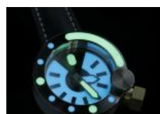
Angular Momentum Dive-Tec/500 Watch