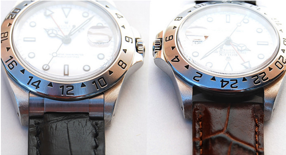
The Everest End Link: Notice A Perfect Case Fit!

A simple DIY for removing and installing Rolex straps is posted over at Minus4Plus6 . Making the Everest strap installation an easy affair are the solid endlinks that slide right onto the case. There is no stuffing a leather strap around a spring bar, or no wedging leather between a springbar and a case, as is the case with thick leather NATO straps. Slide the end link on, make sure the included springbars set into the case and your off.