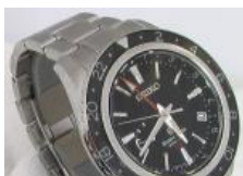
Rare Grand Seiko GMT Spring Drive Watch ...