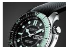
Bremont Supermarine 500 Watch: First Diver