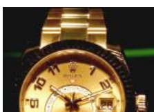
Rolex Sky-Dweller Watch