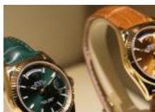
Baselworld 2013: Rolex Announces New